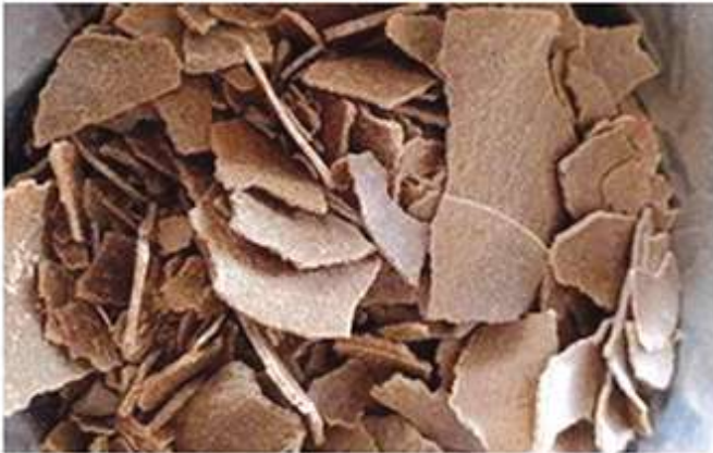
Ground nut oil cake