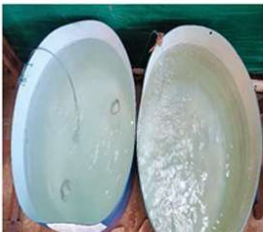
100 l. tank