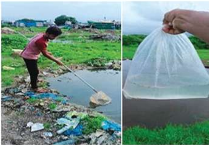
moina inoculam collecting

Maintenance of Temperature and pH: A reservoir tank, in which water of 7-8.5 pH range was prepared. maintain the temperature 21 - 27 °c