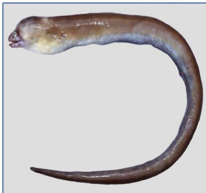
Fig. 2. The short brown unpatterned moray eel

The holotype of this new species is registered at the National Fish Museum and Repository of the ICAR-NBFGR, Lucknow. The name of the species is registered in ZooBank, the online registration system for the International Commission on Zoological Nomenclature (ICZN). The discovery was accepted by the international scientific community and the findings published in the international peer-reviewed journal "Zoosystematics and Evolution".