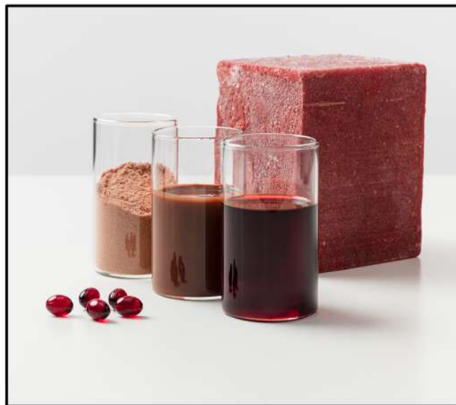
Fig. 5. The Zooca Powder.