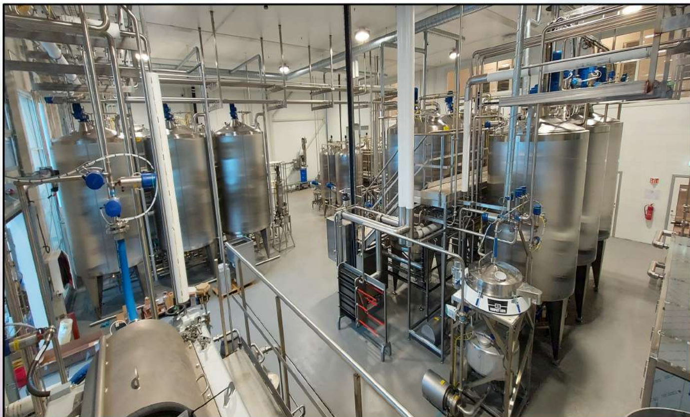
Fig. 3. The Zooca Process Plant Tromsø Norway

Zooca® products are designed to meet the nutritional needs of aquaculture animals while addressing the industry's sustainability and quality concerns. With innovative formulations and production techniques, these products contribute to the advancement of aquaculture practices, supporting the growth and success of shrimp and fish farming operations.