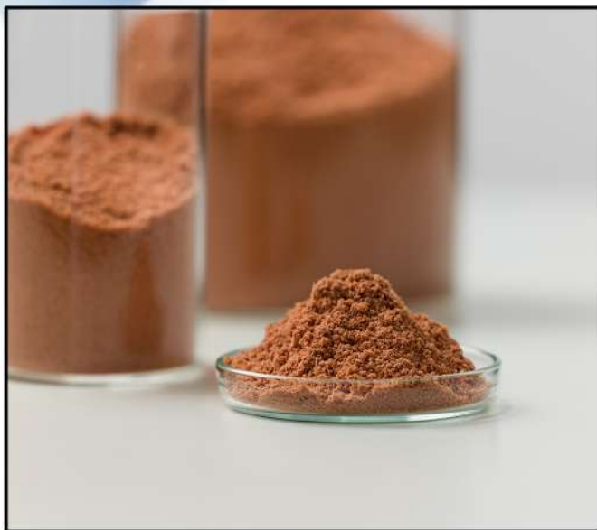
Fig. 4. The Zooca Powder.