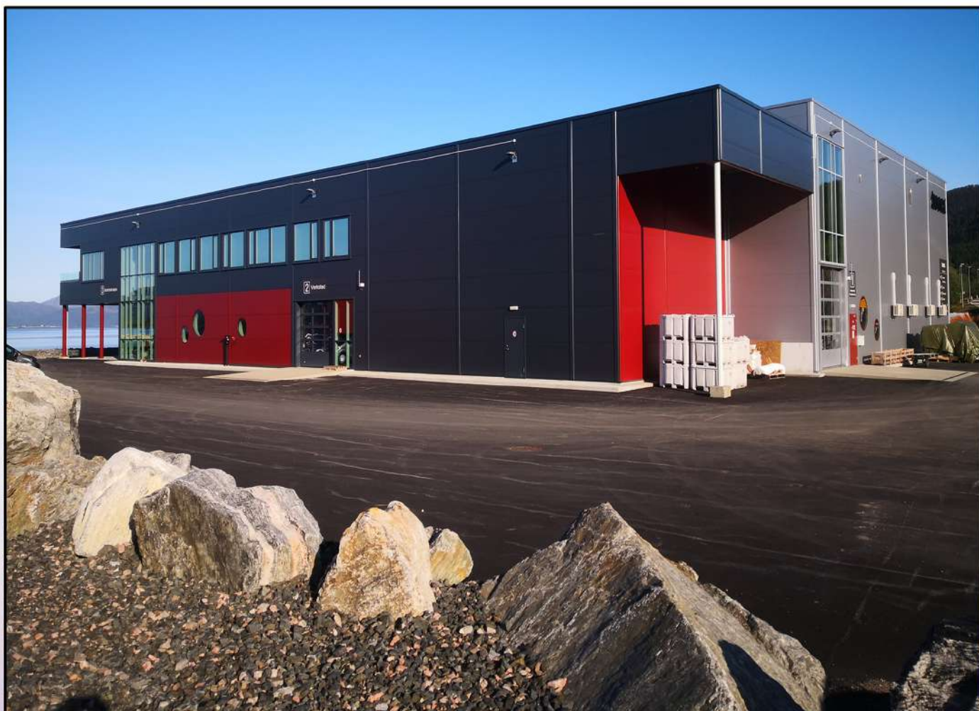
Fig. 6. The Zooca Plant Tromsø Norway.

Zooca believes that the solution to global challenges begins with the individual choices of feed producers and shrimp farmers and that the tiniest things can have the biggest impact.