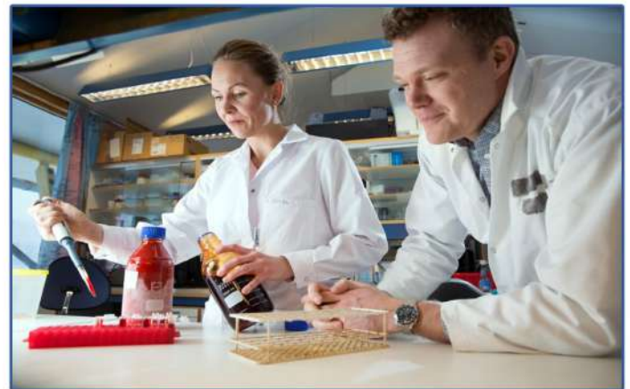
Fig. 1. Testing & QC at Zooca

The shrimp farming industry has experienced significant transformations over the past few decades, becoming a dynamic and global practice in over 50 countries. However, it faces various challenges, such as viral, bacterial, fungal, and other diseases, the demand for innovative ingredients to support aquafeed production, and environmental impact. Zooca, the Calanus Company provides products designed to address these challenges and mitigate their effects.